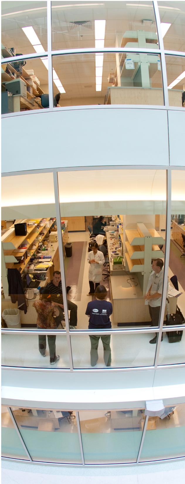
The Robert H. and Clarice Smith Building has doubled the amount of research space at the Wilmer Eye Institute. The five floors of open lab spaces support a collaborative research approach, which has revolutionized the way research is conducted at Wilmer.