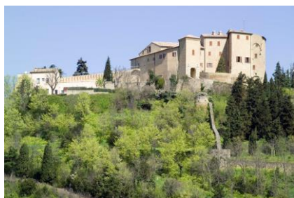
The course venue: Rocca di Bertinoro

For registration and information: http://www.ceub.it mmichelacci@ceub.it (rpartisani@ceub.it)