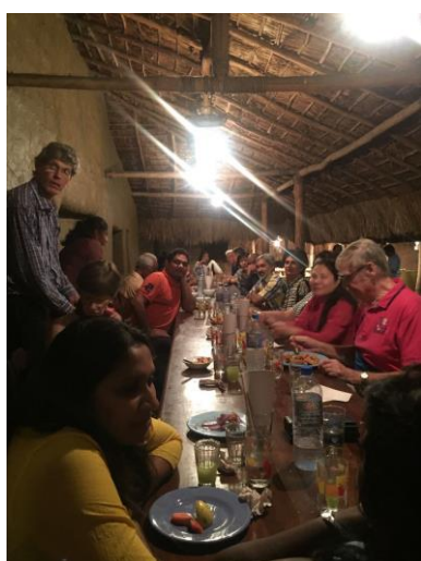
Traditional Sri Lankan Dinner during the conference

The Second day of the congress had a free paper session and two symposia on sexual health and HIV.