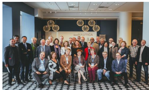
Council of IUSTI-Europe

And, additionally, national representatives from different European countries.