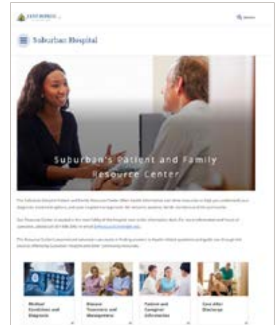
People seeking assistance in navigating the virtual Resource Center website or locating information not available on the website can leave a voice mail message or send an email with assurance a PFA will respond within one business day.

As federal, state and local governments — as well as Johns Hopkins Medicine and other health systems — continue to roll back COVID-19 restrictions, we are optimistic about the opportunity to reopen the in-person resource center in the near future.