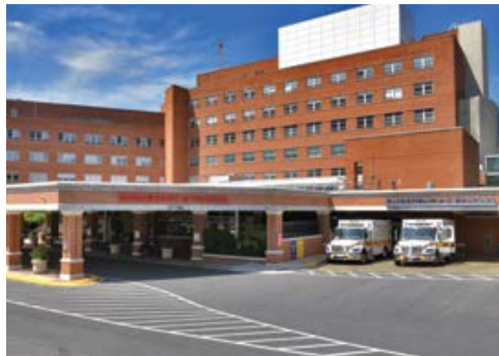
Outside entrance to the ED in Suburban's South Building.