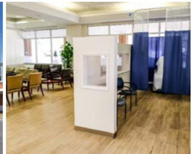
New Suburban ED waiting and triage area.