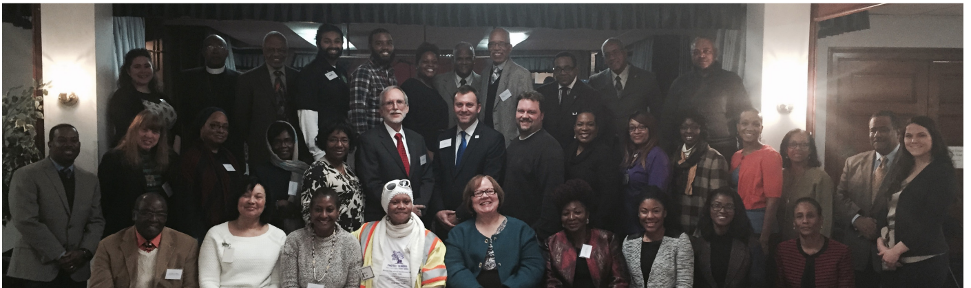
Medical-Religious partners brunch at Zion Baptist Church