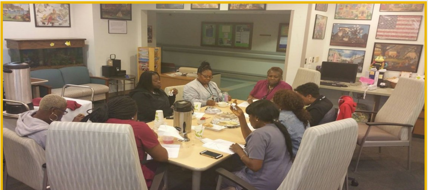
Ren Research Café featured above. The club uses the Day Room so they can still hear and see call lights.

In June, the nurses on the night shift on the Sibley Renaissance initiated their own monthly journal club, called The Research Café as an expansion of the original day shift journal club. From 0200-0300 the team convene (after completing their purposeful rounding) to discuss a research article focused on prevention of patient falls. Two co-facilitators lead the discussion, which they describe as an energizing and fun opportunity, that includes RN, LPN, CA and CNA staff, enabling them to discuss openly and honestly how we have opportunities to work together as a team to prevent patient falls on the night shift. One member stated, “We felt like a professional family pulling together to fully focus on the patient. We are looking forward to our next research café!”