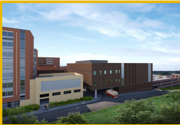
Future location of Sibley's Proton Center from Little Falls Road.

As you know, construction for the proton therapy machine has impacted some employee parking. But what exactly is proton therapy anyway? Proton therapy is a subset of radiation therapy that instead of using x-rays to treat cancer, uses protons – which are positively charged particles. Just like x-rays, protons destroy cells. Proton therapy delivers radiation through the skin from a machine called a synchrotron or cyclotron. After the protons reach the desired place in the body, they deposit an identified radiation dose into the tumor. The fantastic benefit of proton therapy as compared to x-ray radiation is that with proton therapy, physicians can control where the bulk of the proton energy radiation is released. Limited radiation reaches healthy tissue beyond the tumor, which typically leads to damage and undesirable side effects for the patient. Sibley is very fortunate to have one of only 20 proton therapy centers currently operating in the country!