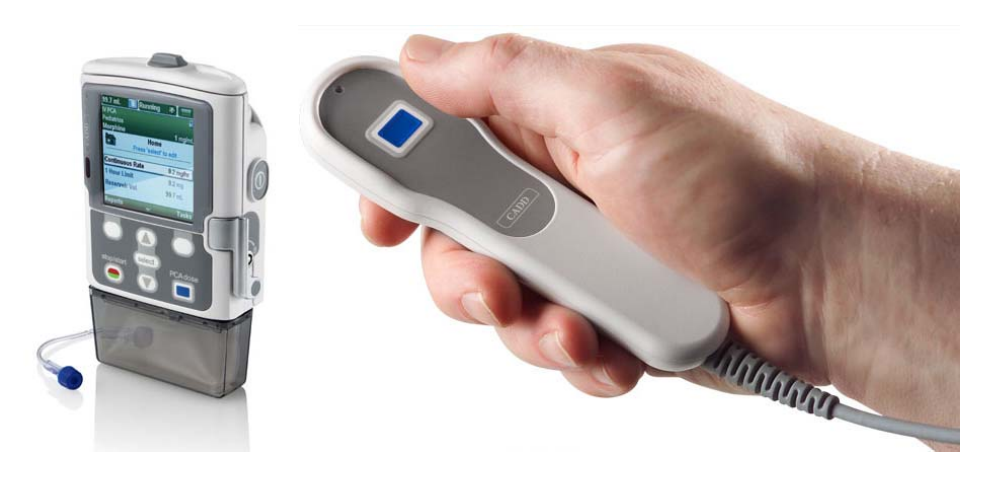
Figure 2: Patient controlled pump for pain catheter

If you are going home after surgery and have a catheter, then there is pump made of plastic which has a reservoir of numbing medicine which looks like a bulb or balloon filled with fluid (Figure 3). This bulb attaches to the catheter and is designed so that it will deliver the medicine to the catheter automatically without you having to push any buttons. The medicine is delivered to the catheter at a steady rate over a few days. When the bulb or reservoir of medicine is gone, then catheter can be pulled out of the neck with no difficult by someone at home. Because the catheter is not sewn in and because it is not under the skin very far, it comes out very easily once the bandage over it is removed.