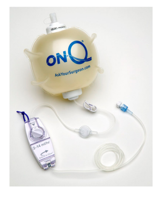
Figure 3: Portable pain reservoir

If you are going home after surgery and have a catheter, then there is pump made of plastic which has a reservoir of numbing medicine which looks like a bulb or balloon filled with fluid (Figure 3). This bulb attaches to the catheter and is designed so that it will deliver the medicine to the catheter automatically without you having to push any buttons. The medicine is delivered to the catheter at a steady rate over a few days. When the bulb or reservoir of medicine is gone, then catheter can be pulled out of the neck with no difficult by someone at home. Because the catheter is not sewn in and because it is not under the skin very far, it comes out very easily once the bandage over it is removed.