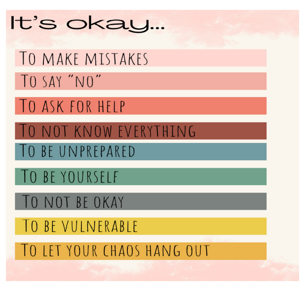
It's Okay- Self-Care Poster