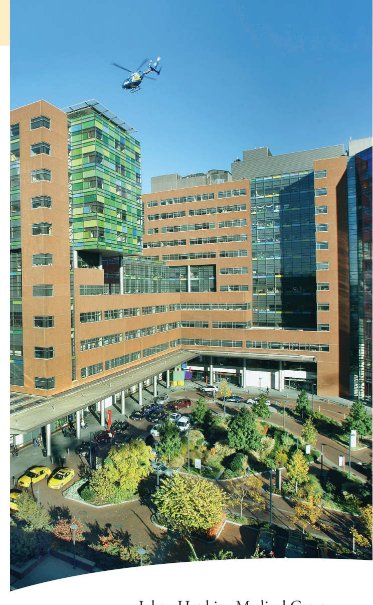
Johns Hopkins Medical Campus Visitor's Guide