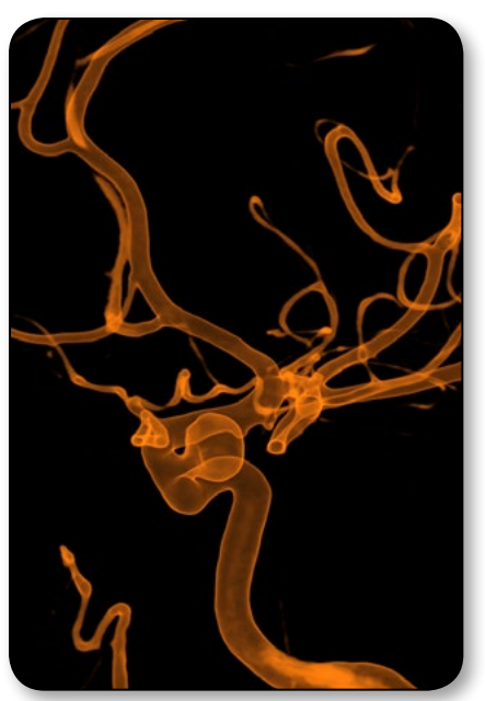
Figure 1. A cerebral angiogram of one side of the brain's blood vessels

Images of the blood vessels are then obtained by injecting the contrast medium through the catheter into the blood vessel, and by taking x-ray pictures as the contrast agent travels through the arteries and veins.