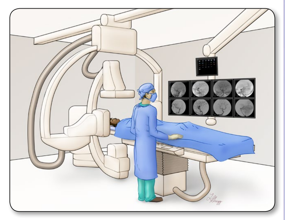
Figure 2. Neuroangiography suite and equipment

You should have nothing to eat or drink after midnight on the day