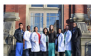
SENSE OF BELONGING, VALUE AND RESPECT