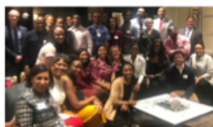
POSITIONS OF POWER