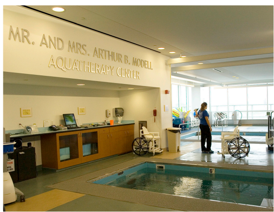
Two pools provide a range of warm-water temperatures, built-in treadmills, video systems for monitoring, jets for resistance and floors that operate on lifts.