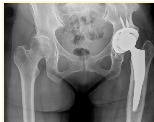
Scans show Sandy Fenton’s hip before and after surgery.