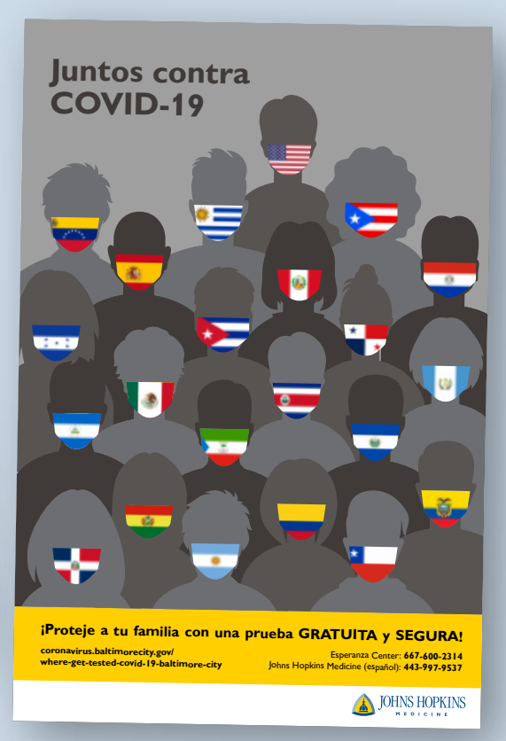
A poster series aims to help connect Latinx patients and their families to health services at Johns Hopkins.