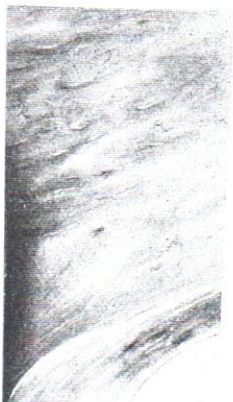
VIEW OF BLADDER

revealed no shadow in this region. Attempts were unsuccessful and it occurred to enlarge the ureteral orifice by stretching tensely over the stone. A linear burn made, starting at the line of the ureteral ridge for a fulguration there was some vesical