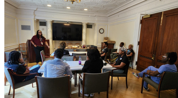
Schaufeld Scholars participating in a mentorship meeting.

This program is open to all applicants, regardless of race or ethnicity. Students with diverse experiences, talents, backgrounds, and perspectives are encouraged to apply. In accordance with applicable law, race and ethnicity will not be considered in the selection process.