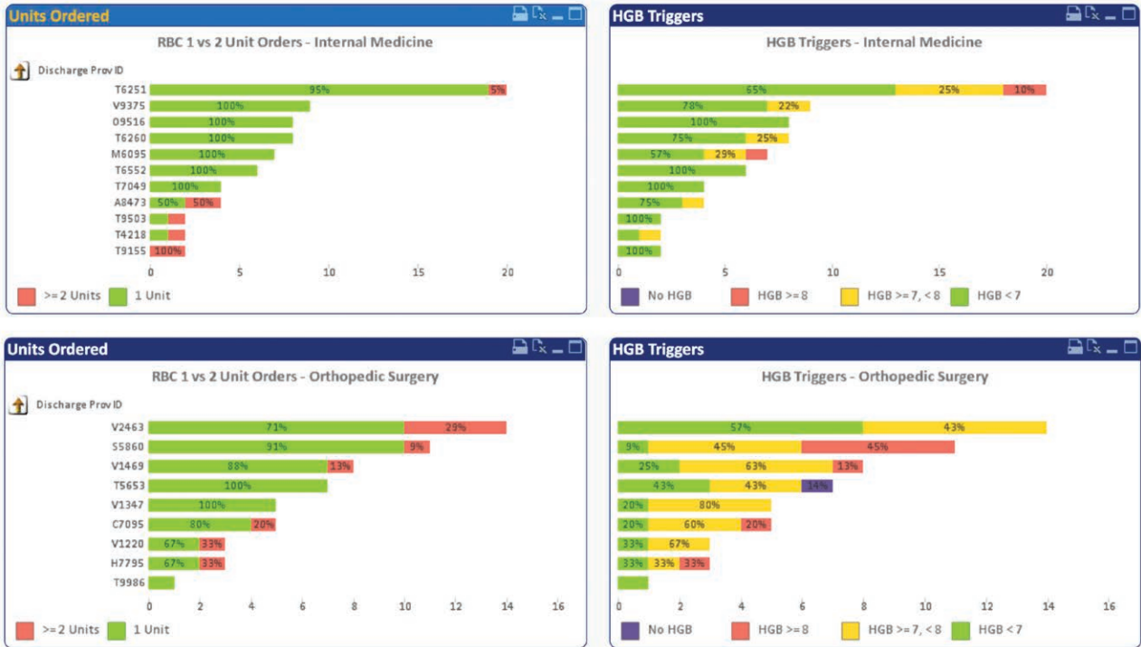
Fig. 2. Two provider-specific departmental blood utilization reports are shown for a 1-month period for the Department of Internal Medicine (top two panels) and the Department of Orthopedic Surgery (bottom two panels). On the x-axis is the number of erythrocyte (RBC) units attributed to each attending physician. Physicians are identified by their numeric identification code on the y-axis. This type of report is sent to each department within the hospital. The proportion of RBC orders is shown according to whether they were for 1 or 2 or more units (left figures) and by the preceding hemoglobin value (right figures) by color coding (green = Hb < 7 g/dL; yellow = Hb 7 to 7.9 g/dL; red = Hb ≥ 8 g/dL). Both departments have a low rate of 2-or-more-unit RBC orders; however, the Department of Internal Medicine has a much larger proportion of RBC orders with a Hb trigger < 7 g/dL. Data were acquired from the Epic (USA) computerized provider order entry system. HGB = hemoglobin; Prov = provider.

In July 2015, we began sending these provider-level reports out monthly at the main campus (JHH), and quarterly at the other four hospitals, to the Vice Presidents of Medical Affairs (VPMAs) and to each department chair, who disseminated the reports to attending physician members in their department. An example of this report is shown in figure 2.