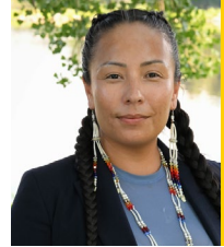
Johns Hopkins Bloomberg School of Public Health Administrative Coordinator