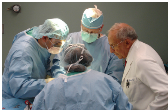
Minimally Invasive Surgical Training Center (MISTC)