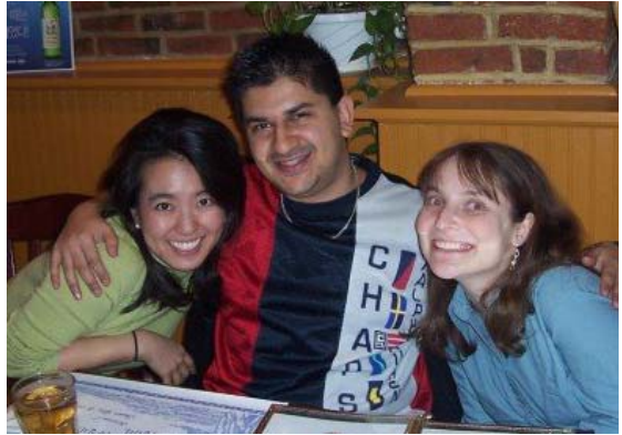
Full of cholecystokinin and oxytocin.

Throughout the weekend, the main attractions at Spring Fair include its multitude of food vendors, bands, carnival rides, and beer garden. It is sure not to be missed and it is a great excuse to not study over a glorious spring weekend ( http://www.jhuspringfair.com/ )