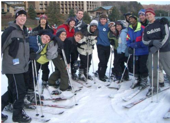
First-years on their winter ski trip.

What you'll find in this section is a short (and I mean short) list of cool places and faces that make Baltimore one of a kind. Baltimore really is a unique city that has a lot of great experiences that you won't find anywhere else. But don't take my word for it. Let this random collection be a guide for your own exploration of "The Greatest City in America."