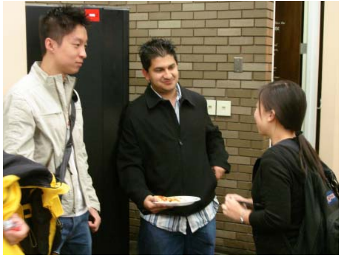
Taking a break in between classes.

for the Cellular Physiology section of Molecules and Cells. You are also assigned to a group of three students. During your one or two days of histology lab each week, your group will listen to/give presentations on the material and take a short Blackboard quiz. Each group gives two