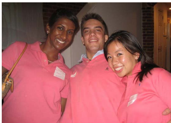
Your everyday essential pink preppy polos.

past a parking lot and through an apartment area. Make a sharp right, if you run completely past the Safeway you've gone too far. Run straight until you reach a small park where there is a large flag and a stone circle on the ground to your left. This is the Korean War Memorial. The brick path along the water pretty much ends here. Turn around and come back and it's just about 5 miles.