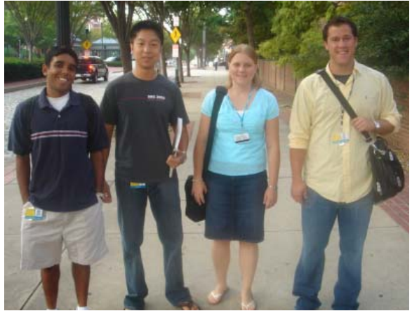
Students walk to their first day of class

Cell Physiology uses virtual microscopy as part of its 5 labs. Virtual microscopy is a new system with traditional slides scanned into the computer and online mini-lectures that you will watch before each lab. The mini-lectures are interesting because the lecturer draws arrows and circles directly on the virtual microscopy slide you are looking at while the lecture audio is playing, sort of like a football game commentator does on TV. When you go into lab (it is a computer lab – you will not need to use actual tissue specimens, though you can look at some), you and your two group partners will study the slides together. The slides are scanned high-resolution images of microscope slides, so you can zoom in to extremely high detail. The great thing about this system is that you can go back to it at home, to study it on your own time. The labs are about an hour and twenty minutes long, and at the end, you and your partners will take an online group quiz comprising about 10 to 15 questions pertaining to that day's lab. It is immediately graded by the computer, and everyone in your group gets the same grade. If you stud-