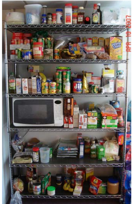
Stocking up on food ... just in case ...

Eddie's Market, convenient location for students living near Homewood campus and makes great deli sandwiches. 3117 St. Paul Street, 410-889-1558