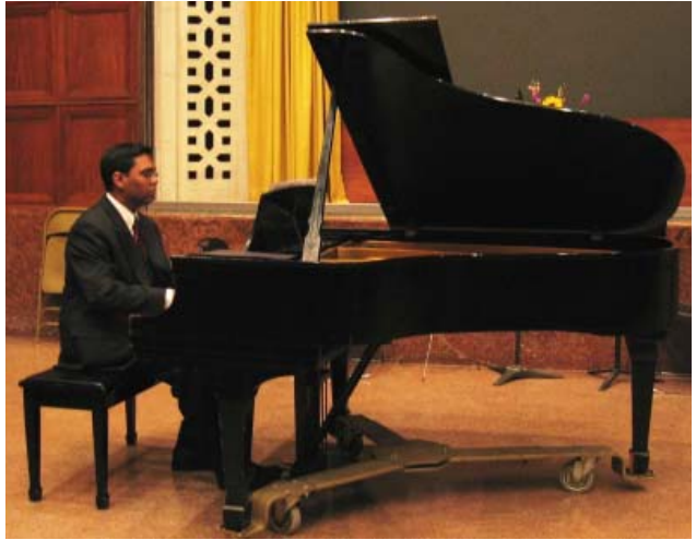
Tickling the ivories in Hurd Hall.