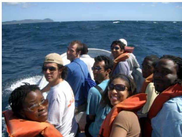
Escaping from class by sea.

"Gunpowder Falls State Park (nearly 18,000 acres in Harford and Baltimore Counties) was established to protect the stream valleys of the Big and Little