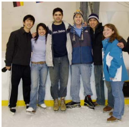
Wintertime means ice-skating ...

Description: Roland Park is north of the neighborhoods mentioned above, and is enjoyed by students looking for a bit of green space or suburban feel in the city. Housing options here can be quite affordable, but students will need to drive 20-30 minutes to get to school.