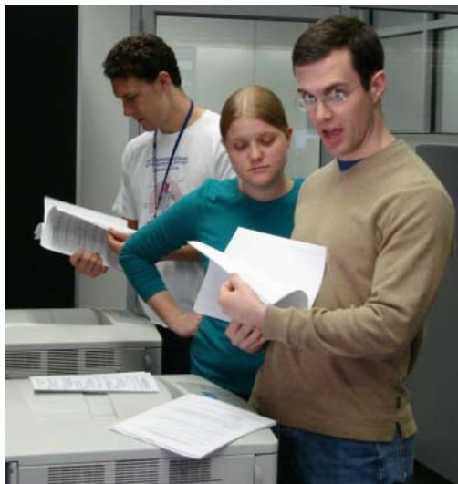
Printing up a storm.

Group vs. individual study – some prefer to study on their own, whereas others prefer to run the material down in small groups. Most of us did a combination of the two. Studying with people who distract you can be great fun depending on how you look at it – but study efficiently, because time is valuable and you may want more time for other things. During Anatomy though, it can be helpful to study with your anatomy group as they can help you make the connections between what you did in lab and what you're reading about.