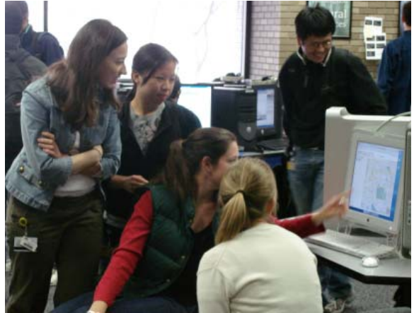
Studying hard in the Academic Computing Center.

As far as books go, the Nolte atlas can be useful for pathways and a neuro textbook can be helpful to clarify confusing points. Neither is absolutely necessary though