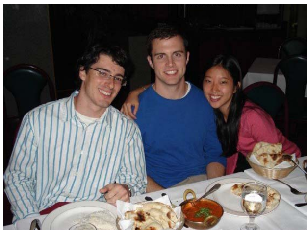
Post-exam Indian buffet.

New Antioch Baptist Church 2401 St. Paul St., 410-889-7040