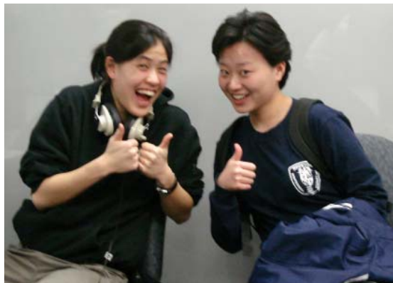
Friends working oh so hard.

Neuroscience: In Neuro you return to sitting in lectures with long lecture notes, so buying the books really isn't necessary. The one exception is the Nolte-Angevine Atlas, which is probably worth buying for neuroanatomy. Or you can always partner with a friend who decided to buy the book. If you want a book, Kandel's Principles of Neural Science is excellent, and its chapters are quite concise (despite being a boulder-sized tome).