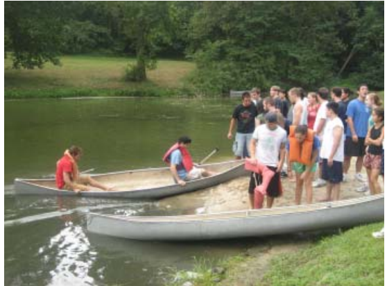
The infamous canoe races at Ramblewood.