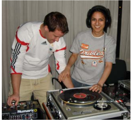
First years making their own music.

Located just south of the Homewood campus, the BMA is easily accessible by the JHMI shuttle and is also currently free. The BMA is open between 11:00 a.m. to 5:00 p.m. on Wednesday to Friday and from 11:00 a.m. to 6:00 p.m. on Saturday and Sunday. The museum is best known for the Cone collection, which includes a fantastic collection of paintings by Matisse, as well as works by Monet, Renoir, Degas, Van Gogh, Gauguin, and Picasso. The museum also has an interesting collection of Modern and Contemporary art, Renaissance and Baroque art, as well as Roman Mosaics. While the non-European art is not as strong, the BMA also attracts a number of large traveling exhibitions. The BMA is also the site of Gertrude's, a wonderful dining destination (see Restaurants).