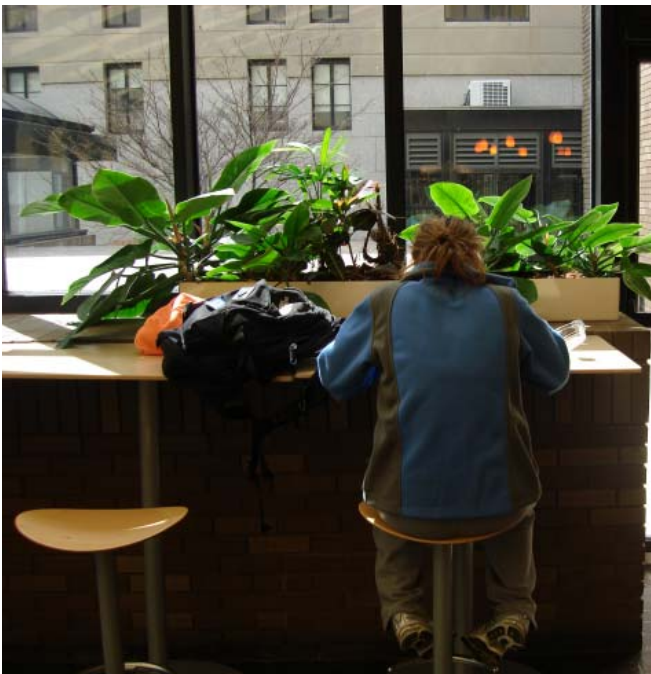
Studying in Greenhouse Cafe.

The course materials for Epi are very well-organized, and there are review sessions offered every afternoon for students looking for assistance