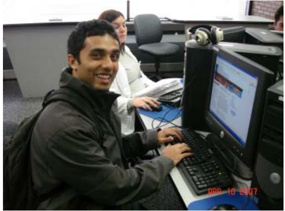
Another happy computer user.

So if you can't get enough learning from the medical curriculum, a variety of very accessible options are avail-