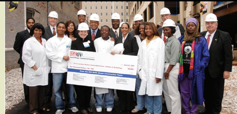
City, state and federal officials join Johns Hopkins and biotech leadership to celebrate a $6,000 donation to the Dunbar High School Science Club from the 855 Wolfe Street construction team, which was presented to students at the topping off event.