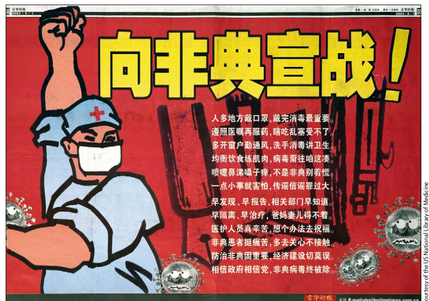
Figure 1: Declare War on SARS! (2003)

This same image of tool-weapons appears in the We Must Eradicate Schistosomiasis poster, in which a local cadre who has allegedly followed the capitalist path of Mao’s rival Liu stands hunched over in shame before a peasant tribunal. Liu is also shown being violently stabbed by a fountain pen in a poster behind the cadre. Although the shovel usually threw out rats of plague and snails of schistosomiasis, in the next panel of We Must Eradicate Schistosomiasis a