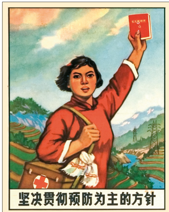
Figure 2: Detail from Take Action to Prevent Respiratory Diseases (1970)

peasant shovels out caricatures of Liu and his associate as the “Gods of Plague”, as lethal to the national polity as snails were to rural society. In the Korean War, posters for the 1952 First Patriotic Hygiene Campaign depicted similar shovelling out of “germ-like” American soldiers and Uncle Sam. During Mao’s 1967–68 campaigns against Liu and Deng Xiaoping, posters show a fist and a Maoist-text-wielding stake attacking the two men. Although from 1959 to 1968, Liu was officially the State Chairman of the