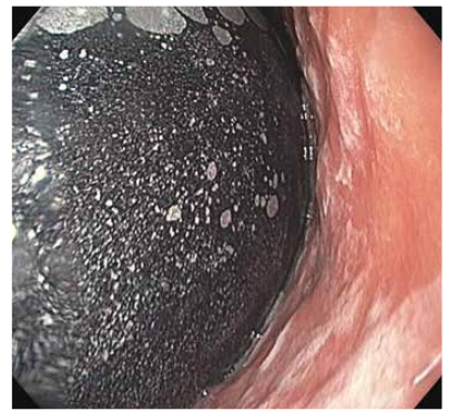
Top row, medical images: Endoscopic sleeve gastroplasty can reduce stomach volume by up to 70 percent. Bottom row: Endoscopic balloons placed in the stomach for a period of six months can reduce hunger and lead to a loss of 5 to 20 percent of body weight.