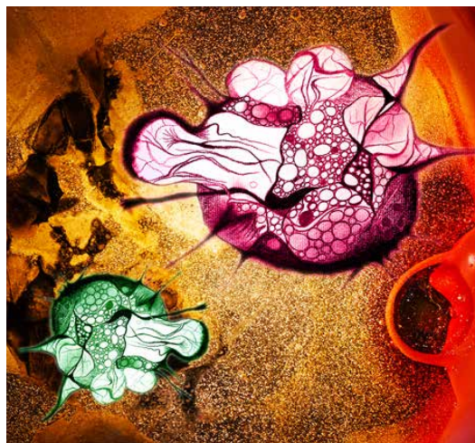
Endometrial cells migrate from the uterus to abdominal cavity and tissue to form endometriosis. Artist's rendition by Ie-Ming Shih.

The team has applied next-generation sequencing and other state-of-the-art technologies to explore the origin, clonal evolution and mechanisms of the metastatic nature of endometriosis. Research-